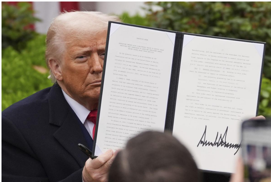
President Donald Trump holds a signed executive order announcing new tariffs during an event April 2 in the White House Rose Garden.